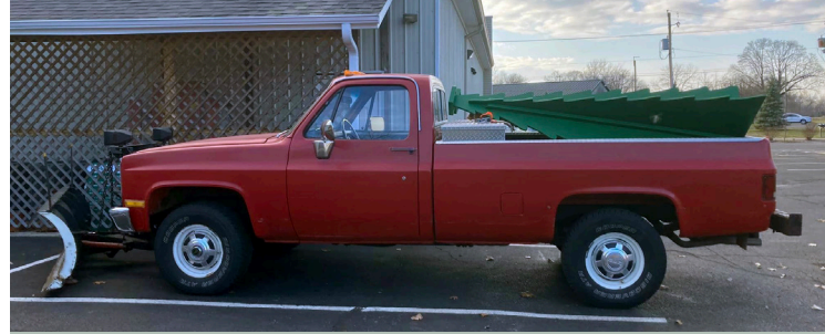
All loaded up and ready to put out trees for our annual Trees of Life campaign!