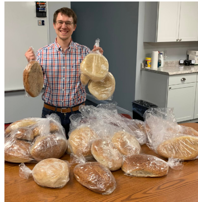
Mackenzie's Bakery in Vicksburg kept us supplied with bread all year long!