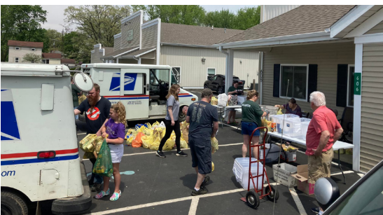
Volunteers sorted thousands of pounds of food that came in from the Postal Food Drive — thank you for your generosity South County!