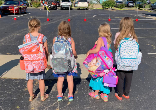
Four kids who were EXTREMELY happy to pick out new backpacks for their first day of school!